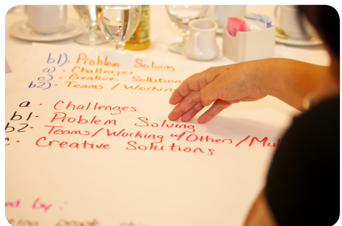
Survive and Thrive workshop participants develop creative solutions.

Through support from the Robert Wood Johnson Foundation and the de Beaumont Foundation, the Survive and Thrive tuition is only $250. The tuition includes in-person workshops, individual assessments, teleconferences, readings, webcasts, one-on-one coaching, and peer learning, including travel.