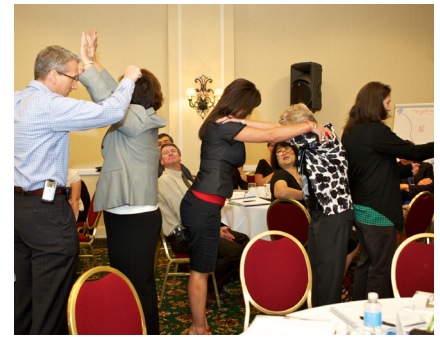
Scenes from an anything-but-typical Survive and Thrive workshop